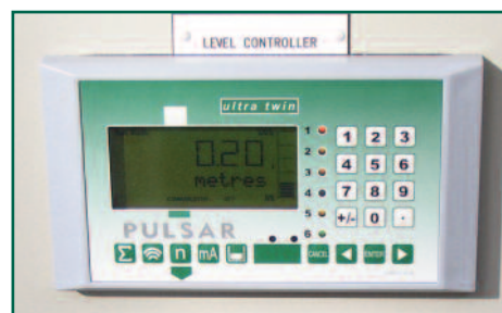
fascia mount version

In pump control configuration, ultra Twin provides all the power of the Pulsar Ultra 3, used throughout the global water industry for critical pump control applications, and more. Extremely reliable level monitoring even in the most difficult applications, ultra Twin also provides a wide range of sophisticated pump control routines to keep the application running perfectly. ultra Twin also includes four digital inputs, making it possible to monitor the performance of other equipment, for example a no-flow signal from a pump can trigger an alarm without the need for a PLC.