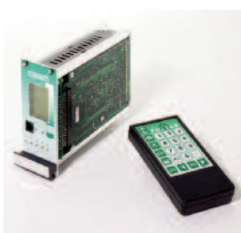
19" rack mount