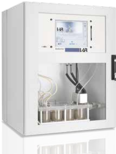
Highly sensitive bacteria in a robust analyser.

BioMonitor simultaneously measures BOD and ASR. Thus, it helps to optimize the treatment processes waste water treatment plants. It can be operated with the plants own activated sludge and depending on the application delivers results within 3 - 4 minutes.